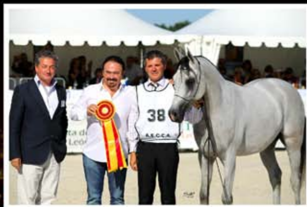
NAPOLEON EA (Marwan Al Shaqab x Nedraska Kossack) Bronze Medal Colts