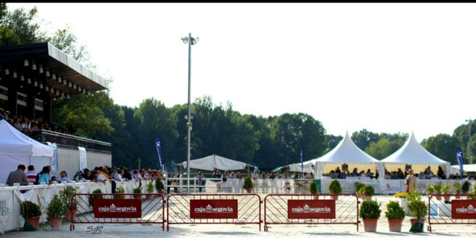
The judges and representative of Al Shahania Stud