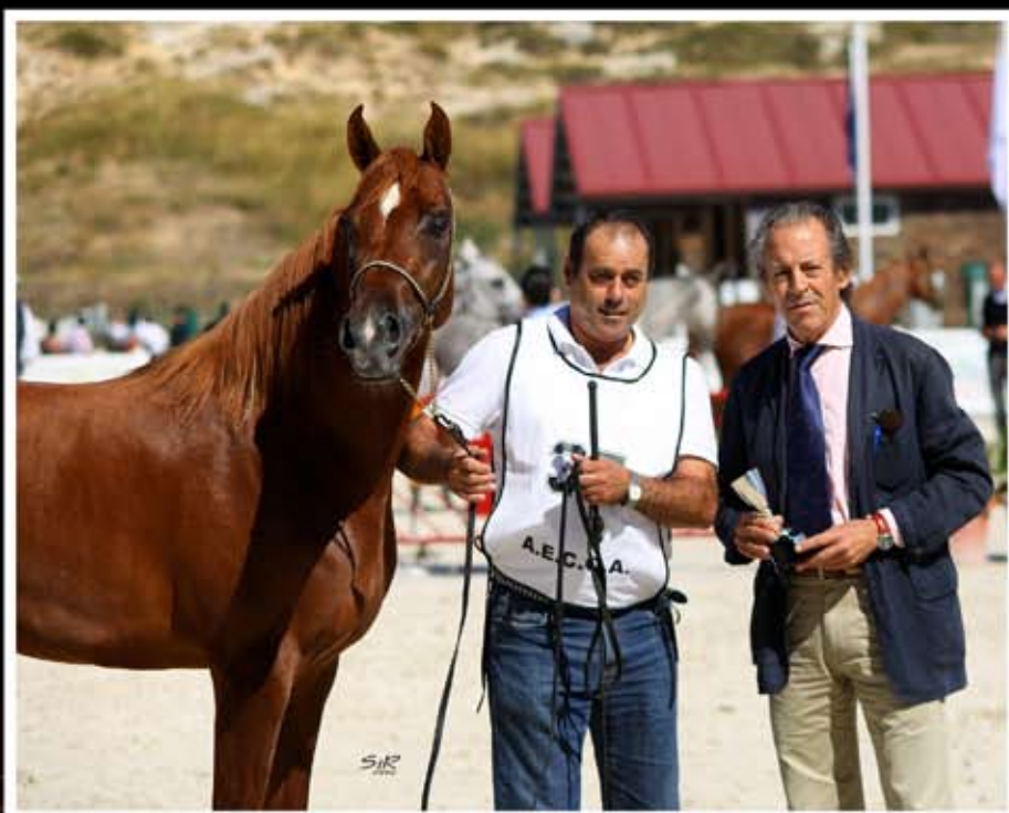
HALIARTO (Envite x Endrina) Highest point males, Straight Spanish born in Spain