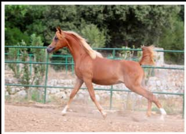
ABHA SHARIK (Abha Peshawar x Abha Nouba x Khidar) Bronze Medal Colts