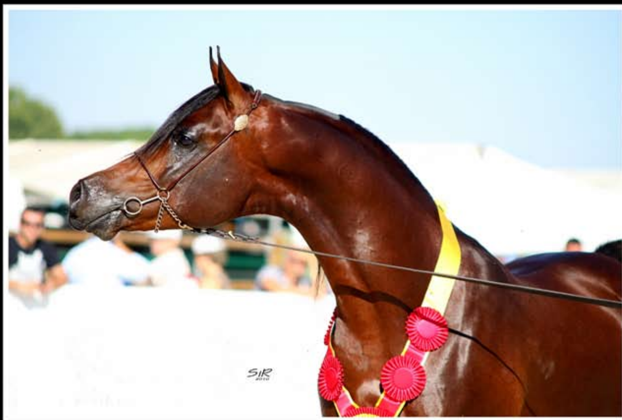
ABHA QATARAH (Gazal Al Shaqab x Abha Fetiye) Gold Medal Colts